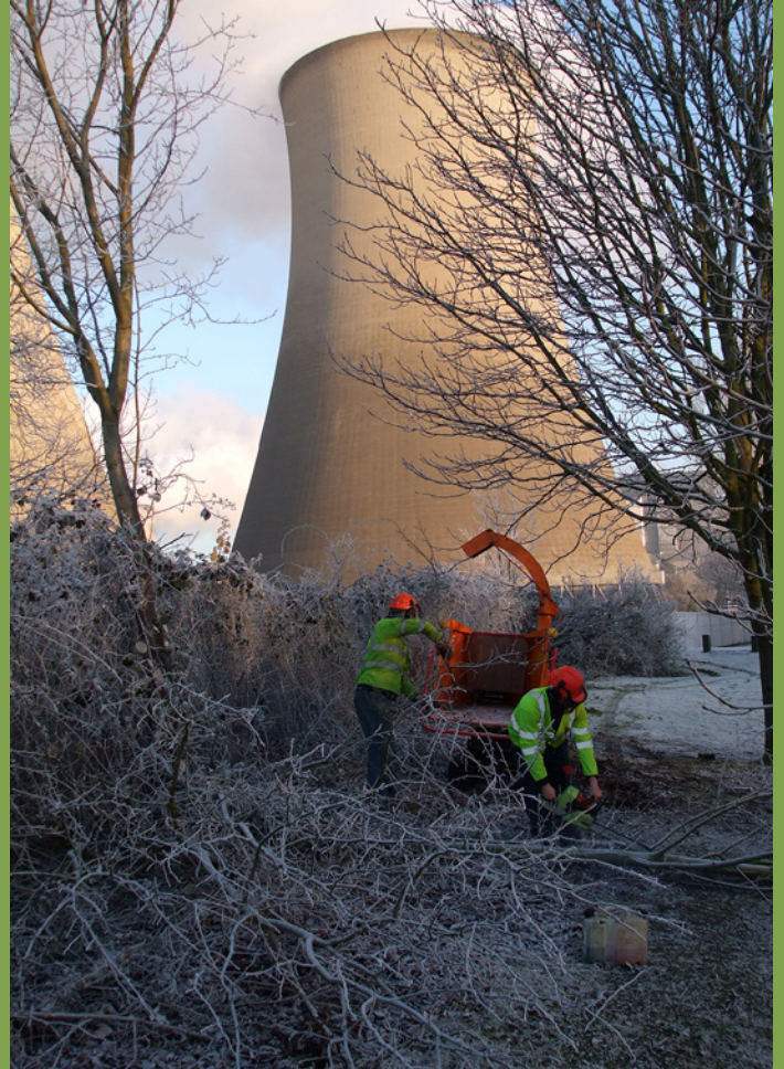
Chipping & mulching