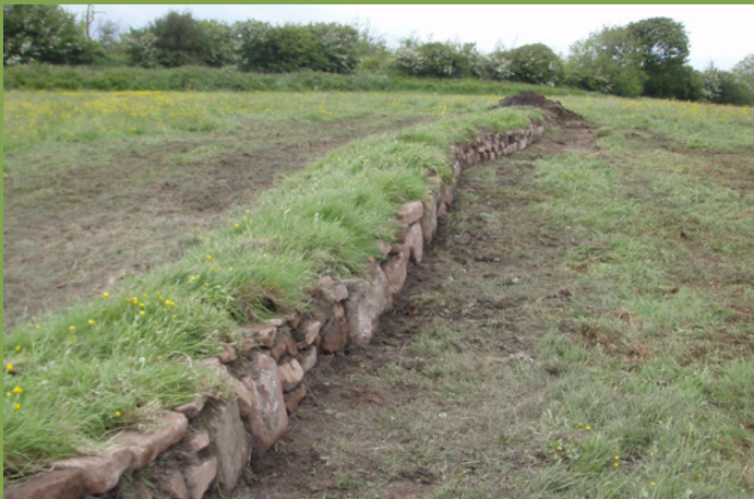
CestWall reptile habitat creation