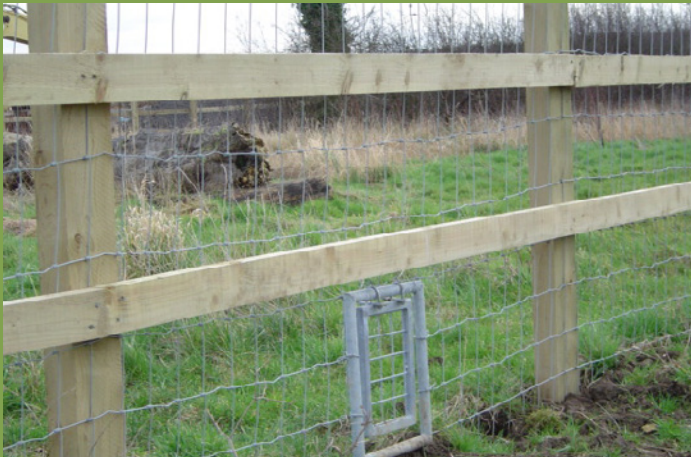
Badger fencing on post and rail