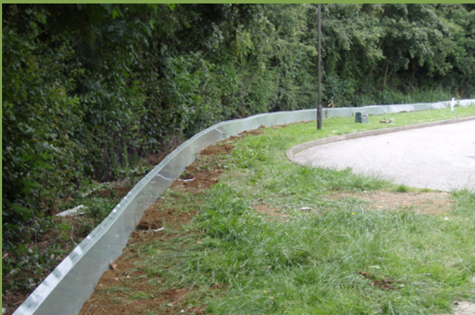
Newt fencing and trapping Three Shires