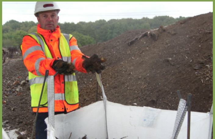
Screened Japanese knotweed rhizome material