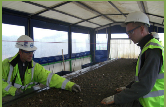
Soil screening picking station