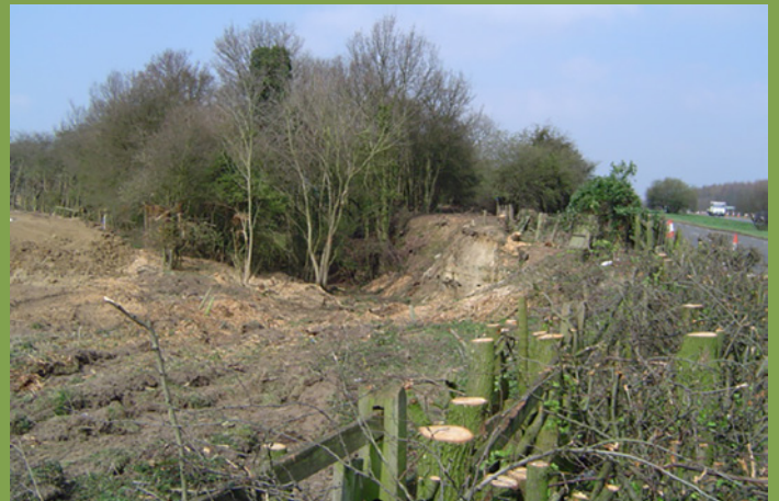
Large scale site clearance