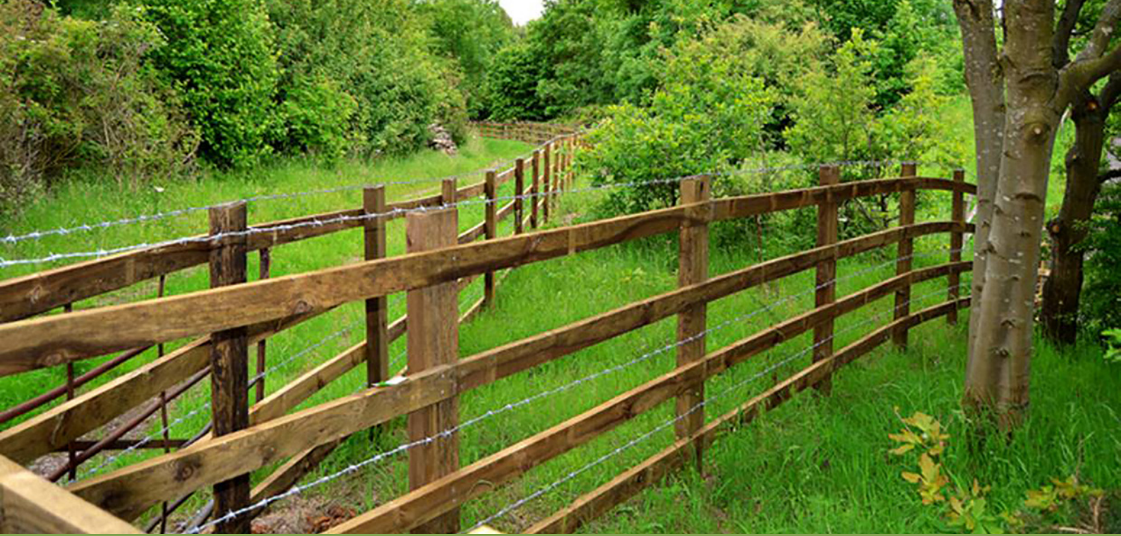
Post and rail fencing