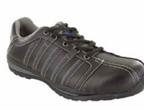
Description Vizwear Apache Viz Colour Vizwear Code Sizes Black VWR611 SZ7-12 £28.64 Safety Specification S1P