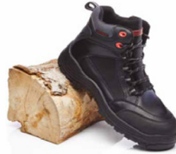
Description Blackrock Pulsar Colour Vizwear Code Sizes Black ROD654 SZ3-13 £35.58 Safety Specification S3, SRC