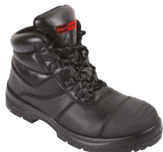
Description Blackrock Avenger Colour Vizwear Code Sizes Black ROD666 SZ6-13 £35.51 Safety Specification S3, SRC