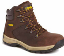
Description Sterling Safety Apache Waxy Boot Colour Vizwear Code Sizes Brown SSW315 SZ6-12 £52.11 Safety Specification S3