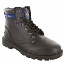
Description Vizwear Cleveland Colour Vizwear Code Sizes Black VWR601 SZ6-13 £26.17 Safety Specification S1P