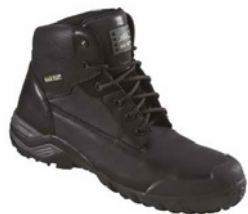
Description Rockfall Flint Boot Colour Vizwear Code Sizes Black/ Brown ROK650/ROK651 SZ7-12 £52.97 Safety Specification S3