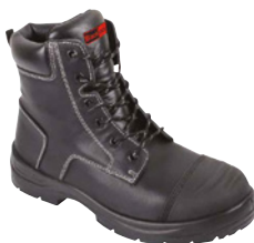
Description Blackrock Guardian Colour Vizwear Code Sizes Black ROD667 SZ6-13 £37.38 Safety Specification S3, SRC