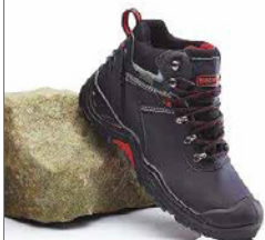
Description Blackrock Tempest Colour Vizwear Code Sizes Black ROD650 SZ3-13 £38.25 Safety Specification S3, SRC