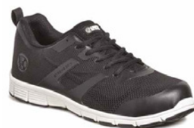
Description Sterling Safety Vault Colour Vizwear Code Sizes Black SSW700 SZ6-12 £44.06 Safety Specification SB