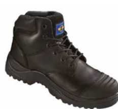
Description Rockfall Scuff Cap Boot Colour Vizwear Code Sizes Black ROK409 SZ6-12 £28.89 Safety Specification S3