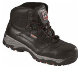
Description Rockfall Dakota Boot Colour Vizwear Code Sizes Black ROK070 SZ6-12 £49.03 Safety Specification S3