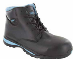
Description Vizwear Ladies Glide Boot Colour Vizwear Code Sizes Black VWR650 SZ3-13 £28.70 Safety Specification S3