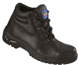
Description Rockfall Chuka Boot Colour Vizwear Code Sizes Black ROK100 SZ3-13 £18.11 Safety Specification S3