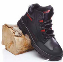
Description Blackrock Panther Colour Vizwear Code Sizes Black ROD642 SZ3-13 £28.99 Safety Specification S3, SRA