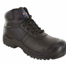
Description Vizwear Kruger Colour Vizwear Code Sizes Black VWR605 SZ6-12 £30.89 Safety Specification S3