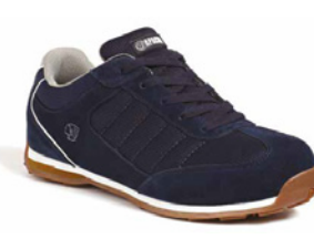
Description Sterling Safety Strike Colour Vizwear Code Sizes Black SSW701 SZ6-12 £42.29 Safety Specification SBP